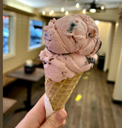
2 scoop waffle cone