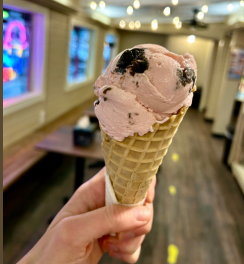
1 scoop waffle cone