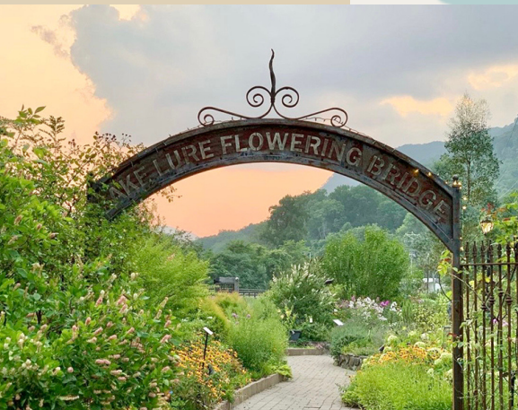
Lake Lure Flowering Bridge